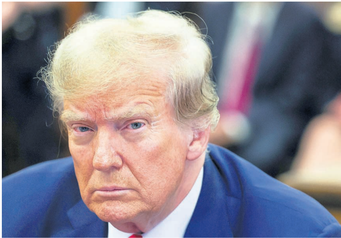
Former President Donald Trump attends the closing arguments in the Trump Organization civil fraud trial at New York State Supreme Court in the Manhattan borough of New York, Jan. 11, 2024.

The judge called the civil fraud at the heart of the trial a "venial sin, not a mortal sin." But Engoron said the refusal by Trump and his associates to admit wrongdoing suggested they would continue if not constrained. "Their complete lack of contrition and remorse borders on pathological," added Engoron, a Democrat. The stiff penalty was a victory for New York Attorney General Letitia James, a Democrat, who sued Trump over what she said was not just harmless bragging but years of deceptive practices as he built the multinational collection of skyscrapers, golf courses and other properties that catapulted him to wealth, fame and the White House. Trump's lawyers had said